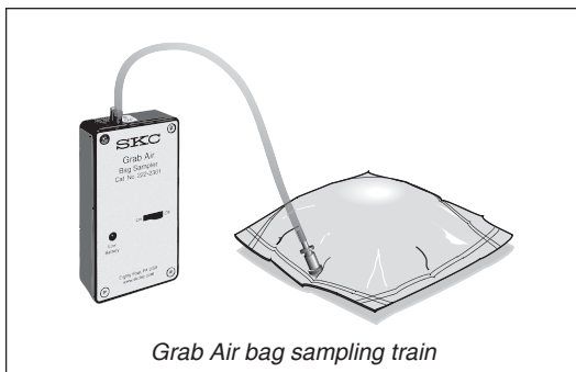
Grab Air bag sampling train

2. Attach PTFE tubing to the exhaust fitting on the top of the pump. Attach the free end of the tubing to the inlet valve on the sample bag. See bag operating instructions for details on operation of bag fitting(s).