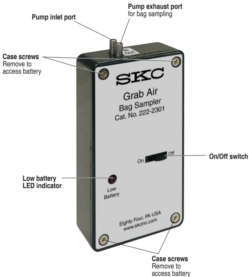
Grab Air Sample Pump, Cat. No. 222-2301

The SKC Grab Air Sample Pump is an economical choice for grab-and-go bag sampling. Grab Air operates at a fixed flow rate of 1 L/min for up to 1000 liters volume on one 9-volt battery. Simply attach a sample bag to the outlet port and turn on the pump. Simple, quick, economical — Grab Air.