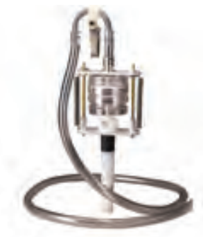
10 mm nylon cyclone is used in NIOSH & OSHA sampling methods

The traditional personal air sampling cyclone in the US is the Dorr-Oliver, 10mm nylon cyclone. It was first utilized in US coal mines in the early 1960's, and it continues to be the most commonly used model in the US. It will follow the US ACGIH size distribution curve (50% cut at 4 microns) closely when used at 1.7 LPM. This cyclone is specified in numerous NIOSH and OSHA Test Methods for use with 37mm, 5 micron, PVC,