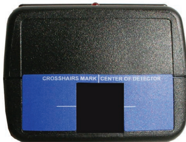
The end panel of the MC1K Shown