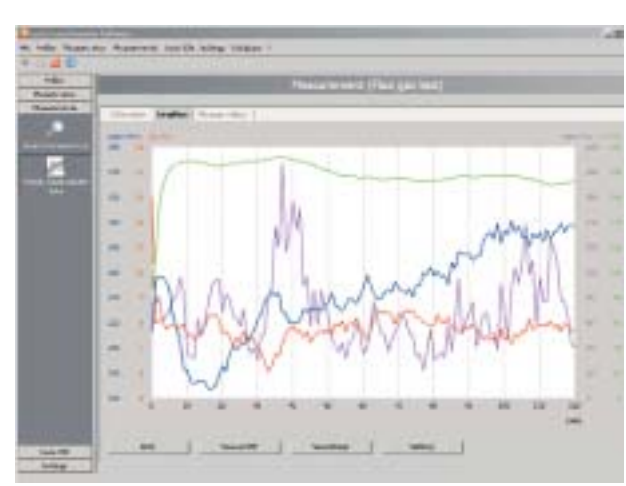
curve diagram - with i. e. 4 measured values on a view