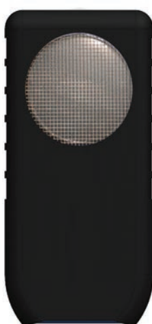
View of Back with Ruggedized boot