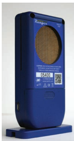
Ruggedized boot and Stand Included