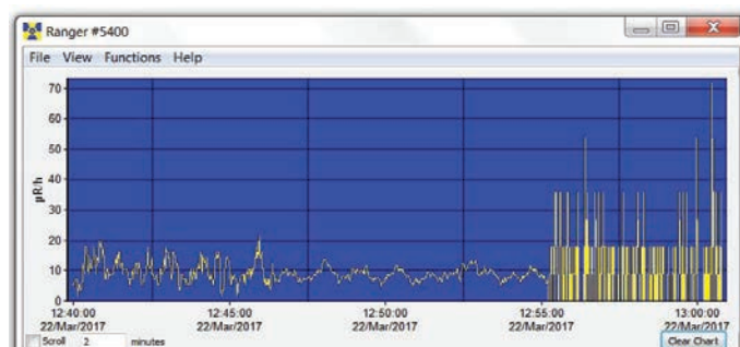
USB Observer Software collects data stored in the internal memory of The Radiation Alert Ranger