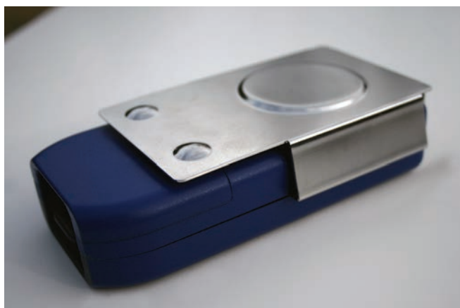
Wipe Test Plate