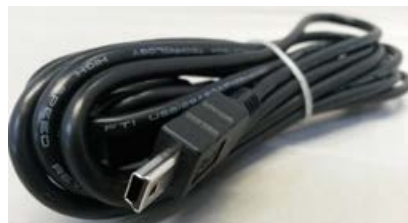
USB Cable for htV-m