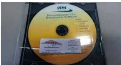
Download Software for htV-m