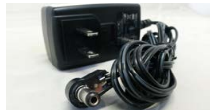
A/C Power Cable for htV-m

Documentation is also available online: https://www.raecorents.com/enmet-formaldemeter-htv-m-direct-reading-datalogging-airborne-formaldehyde-monitor/