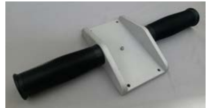
Double Handled Grip