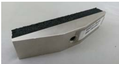
Rectangular Push Attachment