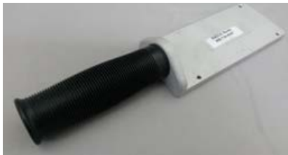
Single Handled Grip