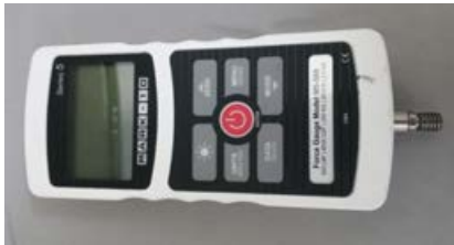
M5-500 Digital Force Gauge

When you unpack the instrument, please try turning it on. If nothing happens, or a kit component is missing, please call 866-736-8347 immediately, so we can correct the issue.