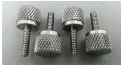
Mounting Screws for Grips