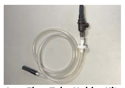
Low Flow Tube Holder Kit

Documentation is also available online: <a href="https://www.raecorents.com/skc-airchek-xr5000-intrinsical-ly-safe-personal-air-samping-pump/">https://www.raecorents.com/skc-airchek-xr5000-intrinsical-ly-safe-personal-air-samping-pump/</a>