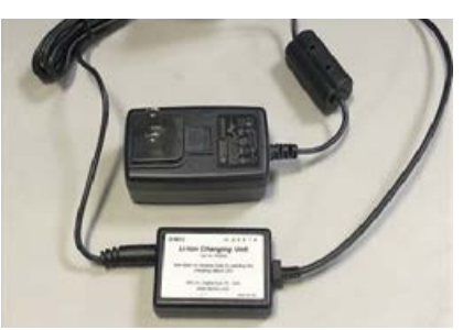
Single Charger Kit