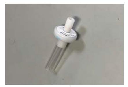
Low Flow Pressure Controller