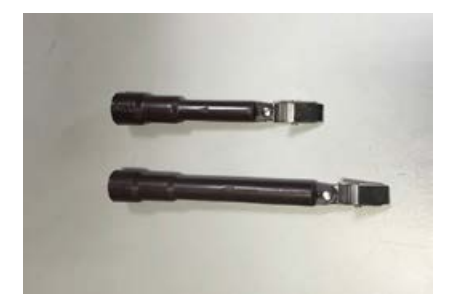
70mm and 110mm Tube Covers