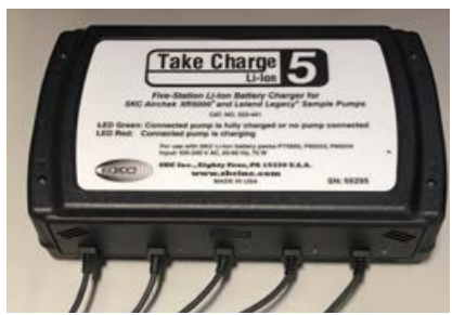
5 Bay Charger