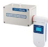
Calibration Kit AS R42