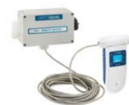
IP41 Remote Sensor Kit AS R13