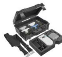
Carry Case Large AS R41