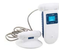
Remote Sensor Kit AS R10