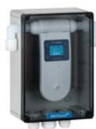
Industrial Enclosure HH ENC