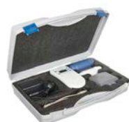
Carry Case Small AS R40